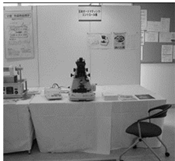
(b) Example of booth layout